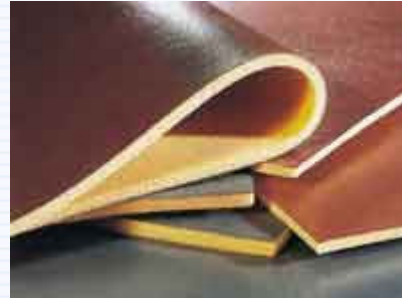
Insulated Thermal Sheets

These quality composites and related products include vacuum bagging support materials, reinforcements, insulation molding compounds and prepregs, thermal and acoustic insulation materials, plastic extrusions, seals, strips and silicone sheets. All products can be supplied in small quantities and custom sizes as well as semi-finished products.