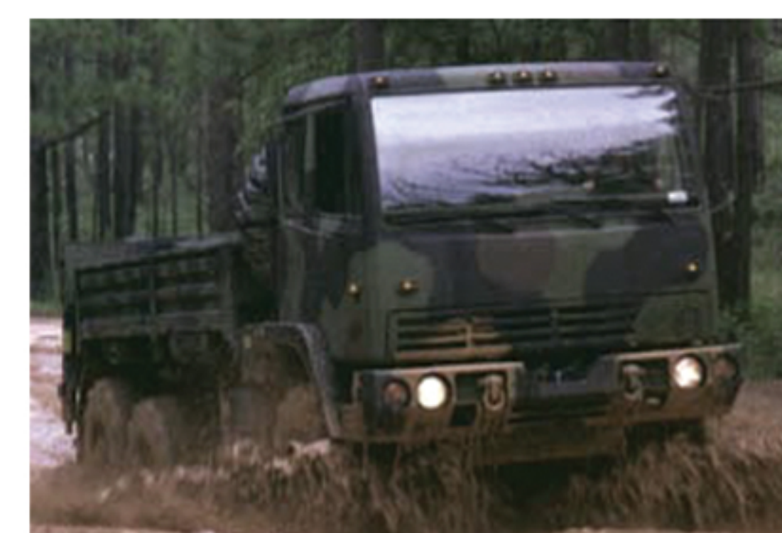
Stewart & Stevenson LMTV