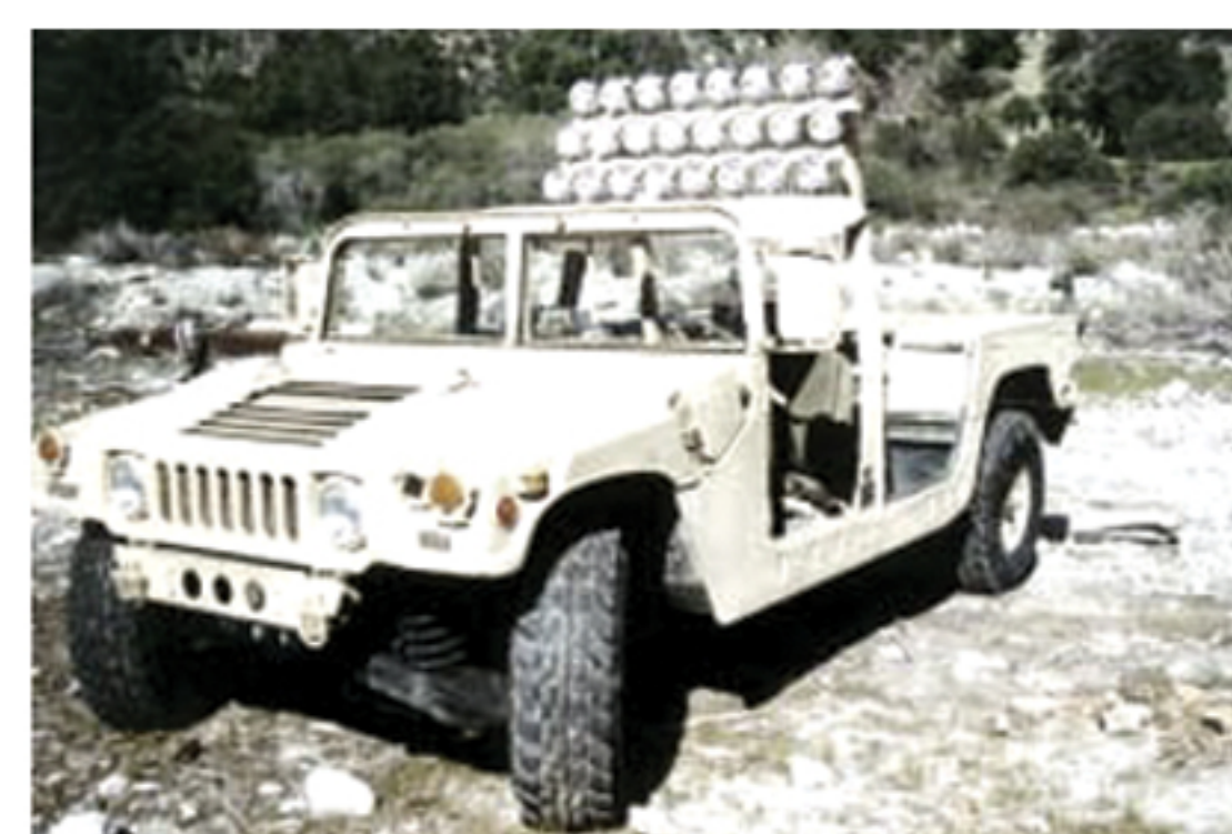
AM General LTV